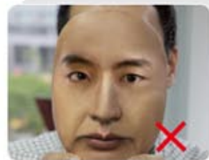
Reject Realistic 3D Printed Masks