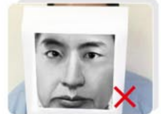
Reject Color and B/W Pictures